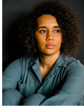
A PAUSE Panel

We will explore the idea that even in the midst of our most difficult experiences, there is often a hidden treasure waiting to be discovered.